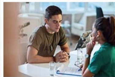
Student Health Forms