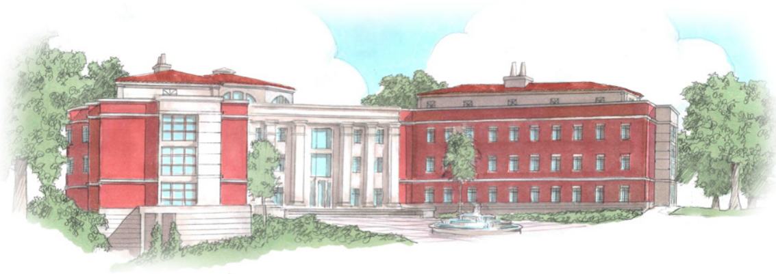
Shelby Hall's atrium