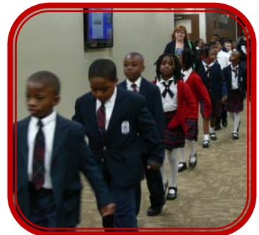
On Campus for a Field Trip