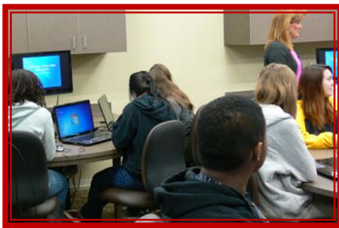
Alabama School of Math and Science Design a Web Page Field Trip