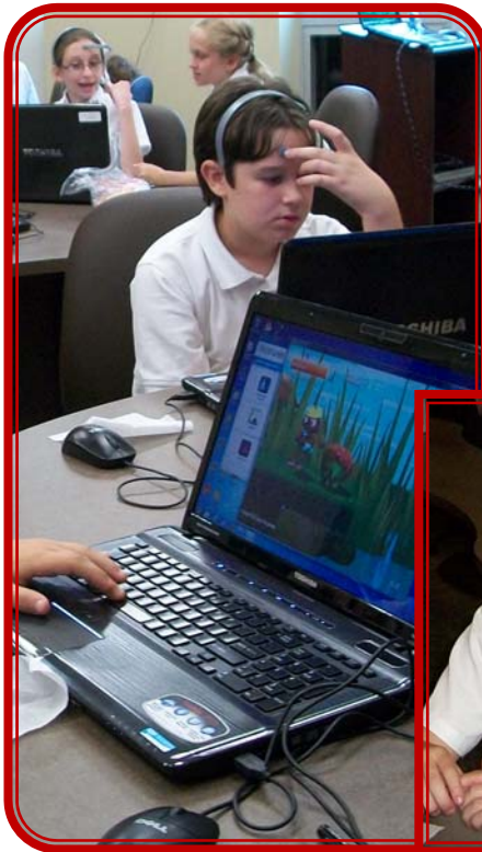
Brain Computer Interface (BCI) Field Trip