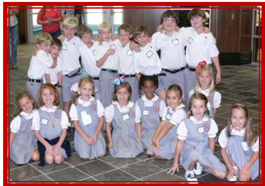
2nd Graders on a CFITS Field Trip to Shelby Hall