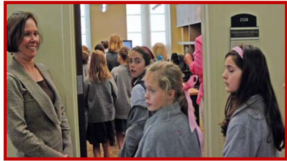
Industry Partner volunteer leads NDEP videos