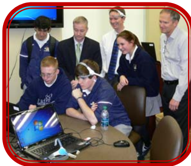
Mobile Christian 10th grade-BCI