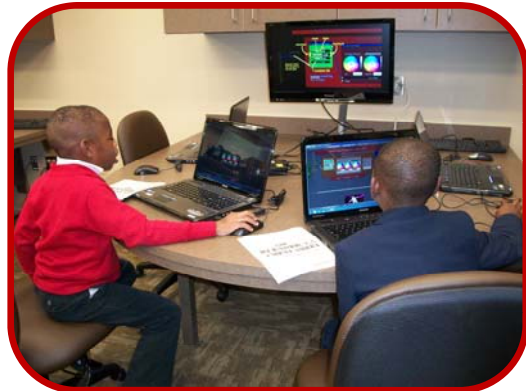
Blender-3D Field Trip with Prichard Preparatory