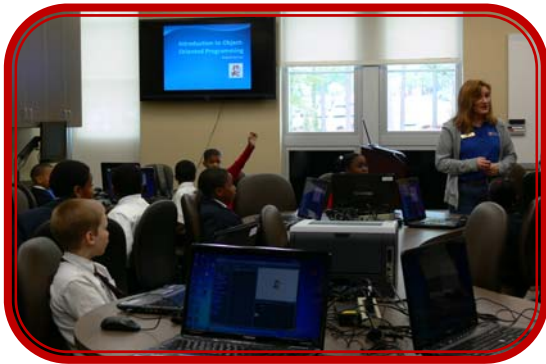
Scratch the Cat (intro to object oriented programming)