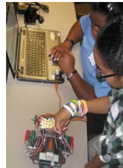
BEST events at SoC